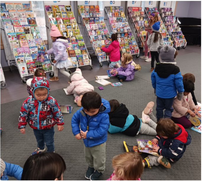
Beginners (Toddlers) Program (Ages 18–36 months)

A peek into the Beginners classroom is always joyful — our youngest emerging learners are busy exploring their world: climbing the stairs to slide down into the reading nook, carefully watering houseplants (and cleaning up the ensuing spills), discovering the functionality of a single knobbed cylinder, and learning to care for their own body and materials. The Beginners Curriculum, housed in a custom-designed child-centered new building, supports the very young child's natural quest to explore the world in a vigorous, hands-on way. It is a "learning by doing" environment in which each child's independence is fostered and supported. It is also a social environment in which toddlers begin to gain a sense of community and an understanding of self.