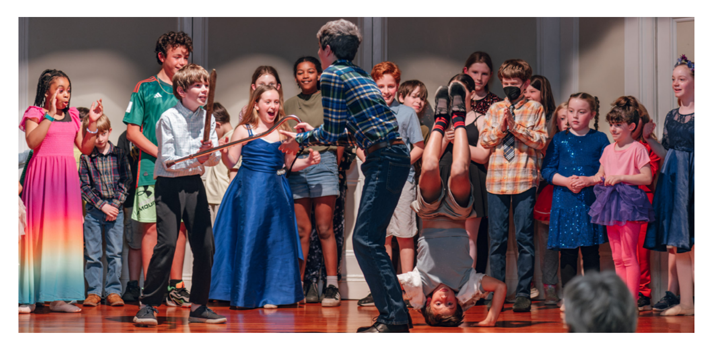
Upper Elementary Program (Ages 9-12; Grades 4, 5, 6)

The older one gets at Summit, the higher you climb. At the top of the building sits the Upper Elementary classroom. With larger bodies and much larger topics to explore, they take over the third floor with big questions and big responsibilities. Their emerging sense of self and identity come into view as they navigate interpersonal relationships, big topics, and leadership responsibilities. The Upper Elementary Program at Summit is composed of a single 4th-6th grade combined multiage classroom. As students progress, the most senior become classroom and school leaders, continuing a cycle of peer mentoring and cooperation. All Upper Elementary students are considered school leaders and stewards, routinely engaging in activities such as serving as morning arrival greeters and campus-wide recycling collectors that support the entire Summit community. Students in the Upper Elementary level engage in individual work as well as collaborative activity in both small and larger groups.