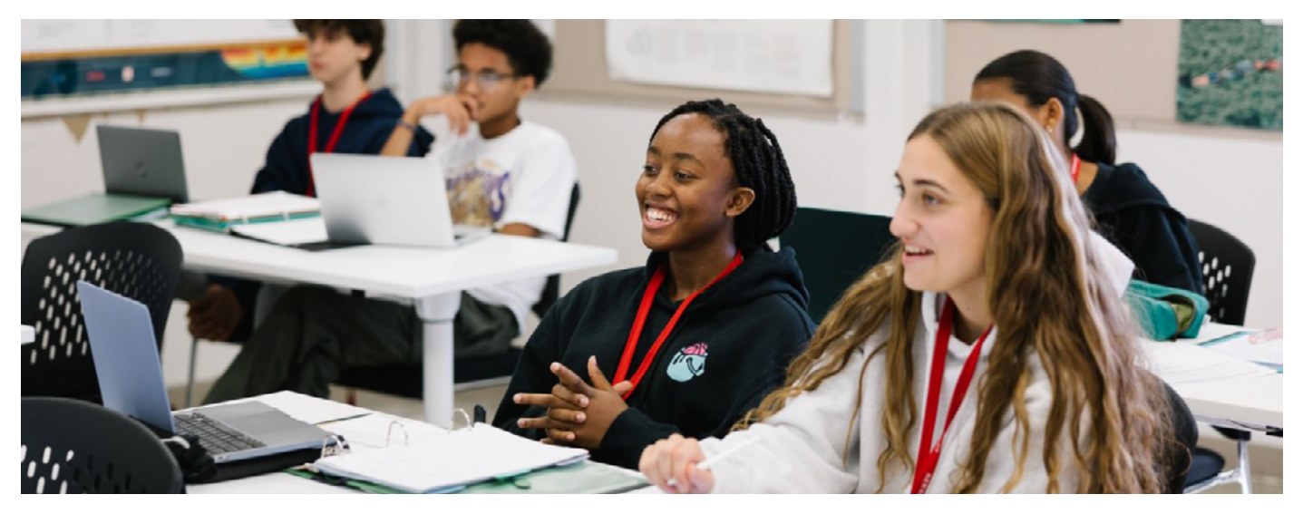
Guide and nurture the school's commitment to diversity, equity, and belonging

Newark Academy is committed to fostering a diverse and inclusive community that empowers its students and families to celebrate their cultural identities, faiths, backgrounds, and heritages. The school recognizes the inherent challenge of this commitment and its work to develop cultural competence among all community members. The school will look to the next Head to guide the community by supporting respectful dialogue, ensuring a safe, inclusive space, and facilitating change in a thoughtful, transparent manner.